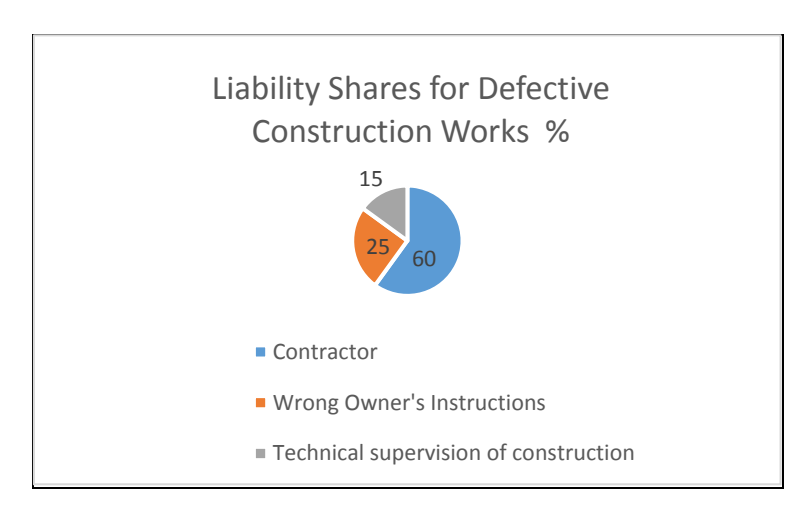
Fig. 2. Liability shares for the defective construction works according Lithuanian case law