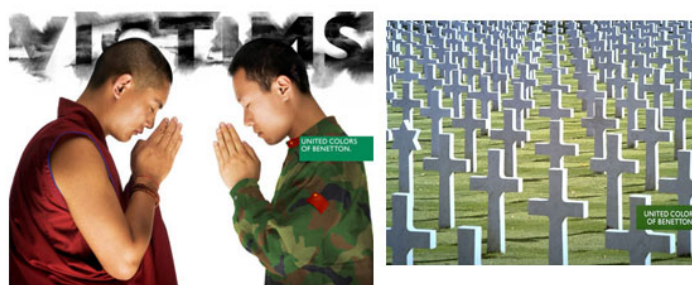
Figure 3. Advertisements of United Colors of Benetton, victims and crosses

At the same time, the company which sells vodka Absolut has a whole campaign of adverts where they are selling the “better world’s idea” despite the ironic fact that the adverts and images they are promoting are the symbols which demonstrate that it is not just alcohol it is the concept of ourselves in front of the world. No need to add that there are a lot of other products such as all ecological or “green” products protecting rights of animals etc. which also sell the idea and symbol of better us (when we buy a specific thing, for example, a product of the Body Shop).