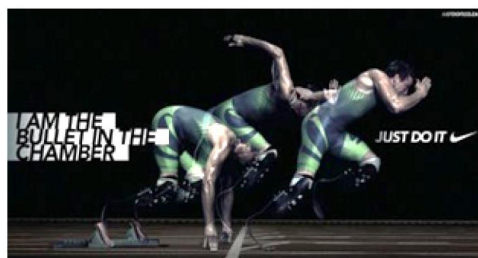
Figure 1. Advertisement of Nike, I am the bullet in the chamber

company United Colours of Benetton had the whole campaign of adverts the main object of which was not a single item of clothing but the social issues such as gender equality, racism, war etc. (see Figure 3). It becomes easy to understand the hint of symbolic consumption when the concept of extended self is taken into account. Genuine self-concept is a method when people observe themselves imagining an ideal person. It is clear that from this extent, advertising companies and marketing specialists are not just using adverts and symbols in order to sell a specific product or service, they have to bring the message to the individuals that they would feel better as persons when they purchase a specific good. Referring to figures 1 and 2, the company Nike is not just selling sports apparel or shoes; they are selling the idea that by purchasing a person would be able to do anything and would feel invincible despite one's different abilities.